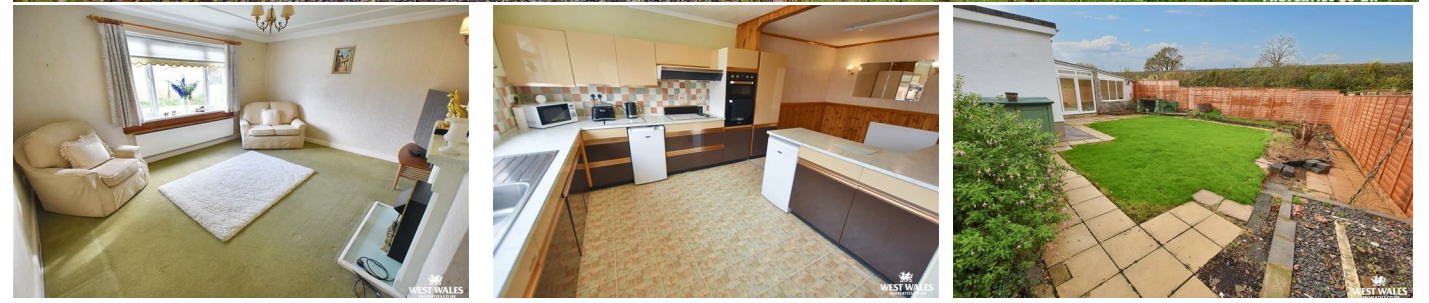
Meadow View Crosslanes, Kilgetty, SA68 0XT